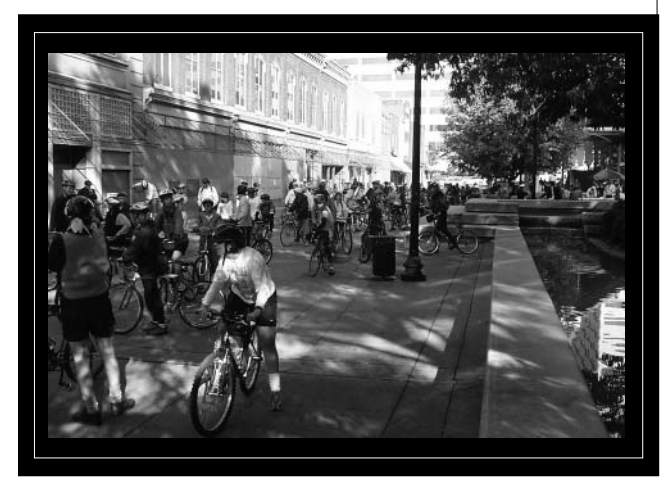
October 2001 neighborhood bike ride.

Develop a bicycle map of downtown, UT and surrounding neighborhoods showing existing conditions on roadways to highlight the best ways to travel by bicycle.