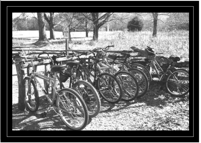
Cades Cove Visitors Center

The US Department of Transportation has released a policy statement on integrating bicycling and walking into transportation infrastructure. Essentially, the statement says that well-designed bike facilities must be included in roadway projects. For more information, see the full statement on page 53.