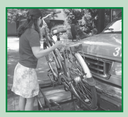
Lift the bike onto the rack, fitting the tires where indicated with marks for front wheels. Use the inside slot (closest to the bus) first.